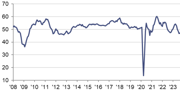
HCOB Eurozone Composite PMI Output Index sa, >50 = growth since previous month