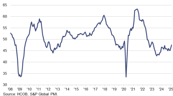
HCOB Eurozone Manufacturing PMI sa, >50 = improvement since previous month