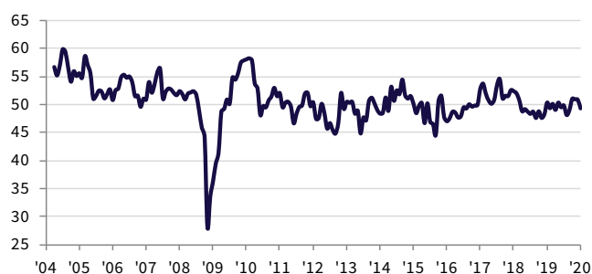
New Export Orders Index sa, >50 = growth since previous month

"China's manufacturing economy recovered at a slower pace at the start of the year. Although corporate confidence was boosted by the trade deal, some manufacturers did not replenish stocks despite the pickup in production, due to limited improvement in domestic and foreign demand. Pressure from rising raw material costs is worth attention. In the near term, China's economy will also be impacted by the new pneumonia epidemic, and therefore need to gain support from proper countercyclical policies."