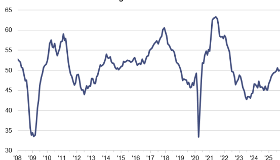
HCOB Eurozone Manufacturing PMI