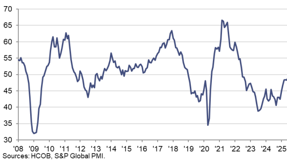
HCOB Germany Manufacturing PMI sa, >50 = improvement since previous month