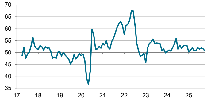
S&P Global Qatar PMI Index, sa, >50 = improvement m/m

Data were collected 9-24 October 2025.