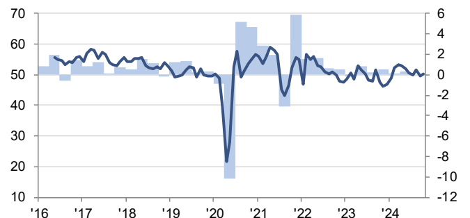
Judo Bank Australia Composite PMI Output Index GDP sa, >50 = growth since previous month %qr/qr

Sources: Judo Bank, S&P Global PMI, Australian Bureau of Statistics via S&P Global Market Intelligence.