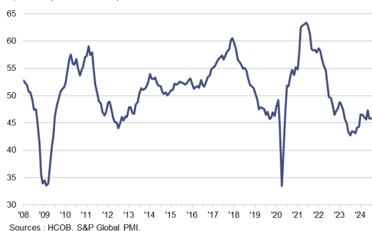
HCOB Eurozone Manufacturing PMI sa, >50 = improvement since previous month