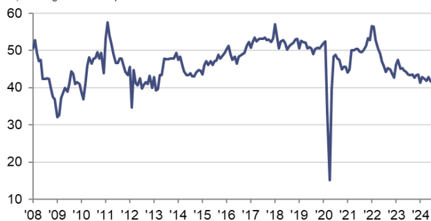
Construction PMI Total Activity Index