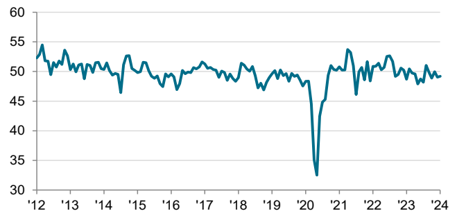
S&P Global South Africa PMI sa, >50 = improvement since previous month

Data were collected 11-29 January 2024.