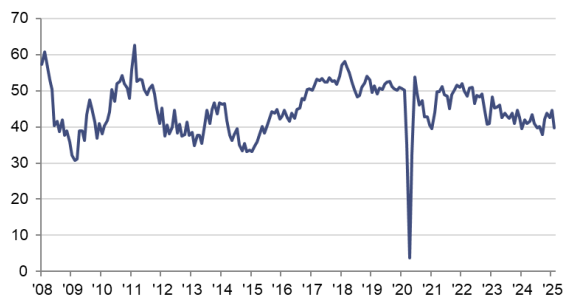
HCOB France Construction PMI Total Activity Index sa, >50 = growth since previous month