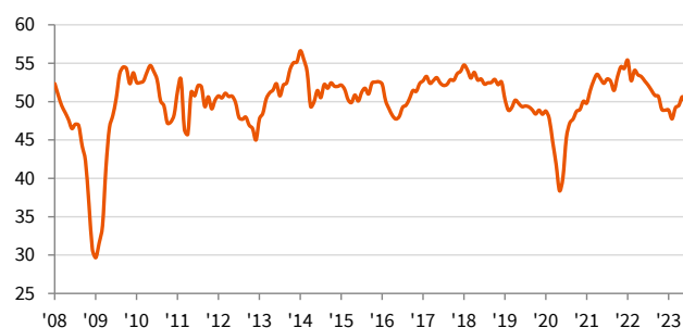
au Jibun Bank Japan Manufacturing PMI sa, >50 = improvement since previous month

Manufacturers commented that inflationary pressures accelerated from July remained historically sharp. Average cost burdens increased at a quicker pace for the first time since September 2022 to reach a three-month high amid ongoing reports of high raw material and labour costs, and exchange rate weakness. Firms sought to protect profit margins however, and increasingly passed