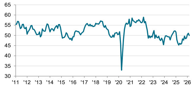
Canada Manufacturing PMI sa, >50 = growth since previous month

Source: S&P Global PMI Data were collected 12-25 March 2026