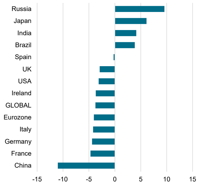
Global Business Activity expectations Change in % net balance, Jun '23 vs. Feb '23