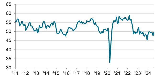
Canada Manufacturing PMI sa, >50 = growth since previous month

Data were collected 12-23 August 2024